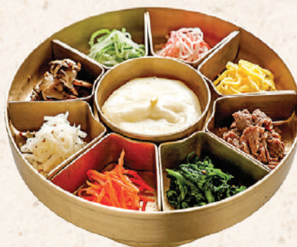
Gujeolpan 구절판 宮廷九節板

Platter of nine delicacies consists of colorful vegetables, meat and wheat crepes. The vegetables and meat are wrapped in the thin wheat crepes stacked in the central compartment and dipped in a mustard-soy sauce.