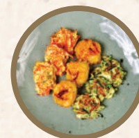
Modeum Jeon 삼색 모듬전 三色煎餅