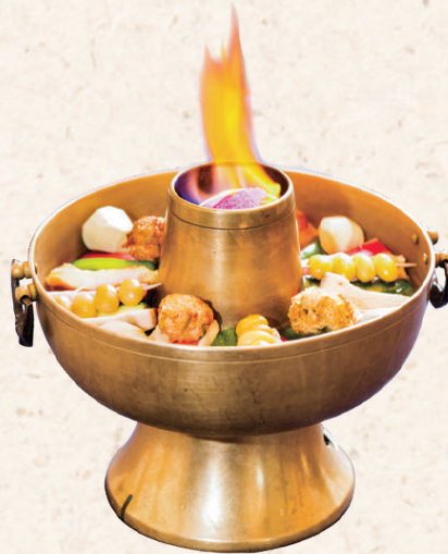
Sinseollo 신선로 宮廷神仙爐

Sinseollo A hot pot of seafood, meat, and vegetables cooked at the tables in a brass sinseollo pot over hot charcoal burning in the central cylinder, A dish representatives of the Royal cuisine.