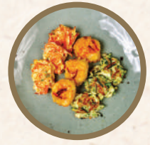
Modeum Jeon 삼색 모듬전 三色煎餅