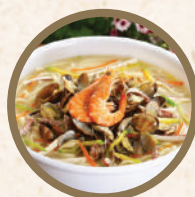
Ramen or Noodle 라면 국수 麵條