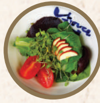
House Salad 샐러드 新鮮私房沙拉