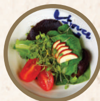
House Salad 샐러드 新鮮私房沙拉