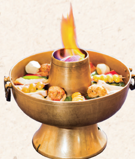
Sinseollo 신선로 宮廷神仙爐

A hot pot of seafood, meat, and vegetables cooked at the tables in a brass sinseollo pot over hot charcoal burning in the central cylinder. A dish representatives of the Royal cuisine.