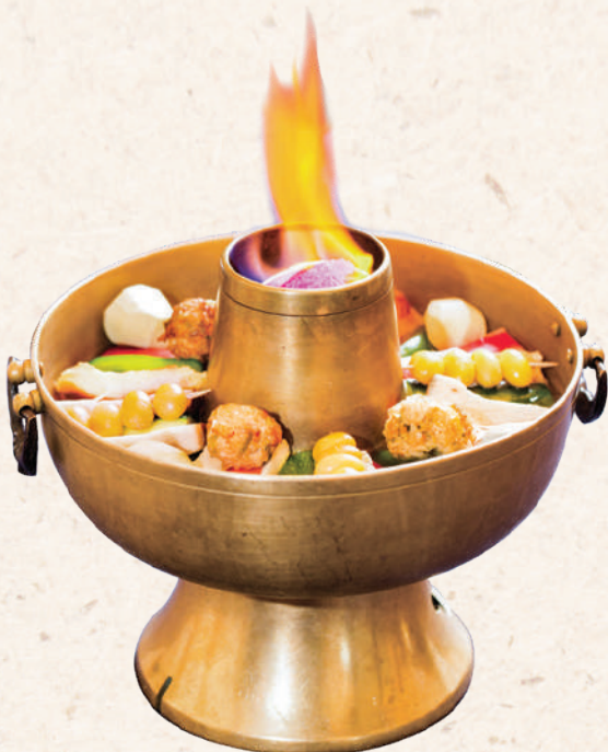
Sinseollo 신선로 宮廷神仙爐