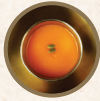
Porridge 오늘의 죽 各式特色粥